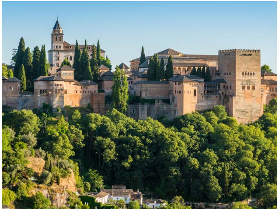
Alhambra de Granada

After breakfast, leave the train and spend the morning exploring Ronda, a spectacular city which is split in half by a narrow gorge through which the Guadalevín river runs. Enjoy the stunning views from the famous bridge and discover the charm of the old town. Eat lunch in Ronda, then board the train in the afternoon