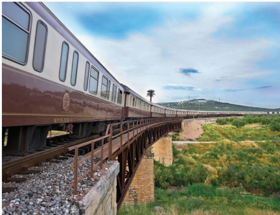
AI Andalus luxury train

Guests looking for a special treat may upgrade to a “Deluxe Suite”. These cabins have a double bed which is a sofa during the day. They have the same facilities as the “Grand Class” cabins and their bathrooms are equipped with a hydro-massage shower/steam sauna.