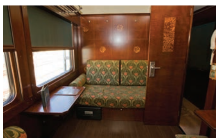
Grand Class cabin